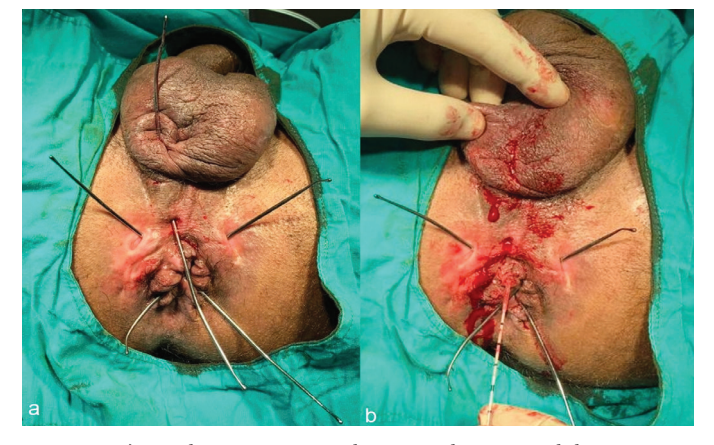
Figure 2. a) Fistulous openings at the perianal region and the scrotum. b) Application of the laser probe from one of the openings