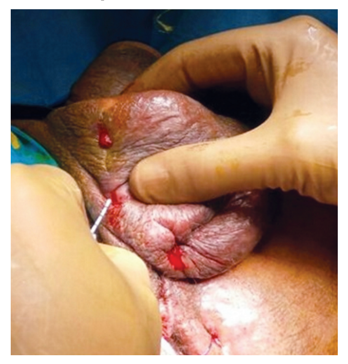
Figure 1. Fistulous openings extending into the scrotum. Application of the laser probe from one of the openings

W) was used for the FiLaC technique. The patients were positioned in lithotomy under general anaesthesia. After widening and debridement of the external orifices of the fistula tract by curettage, a stylet was used to determine the length and direction of the tracts. The laser probe was inserted into the fistula tract (Figure 1) based on the measurements obtained by using the stylet. In the presence of multiple external orifices, more than one stylet was used (Figure 2a) before the probe insertion (Figure 2b). For axillary lesions, the same steps were followed (Figure 3a, b). Then, the activated probe was pulled back at a speed of 1 mm/s until its evacuation from the external orifice. The orifice was left open behind.