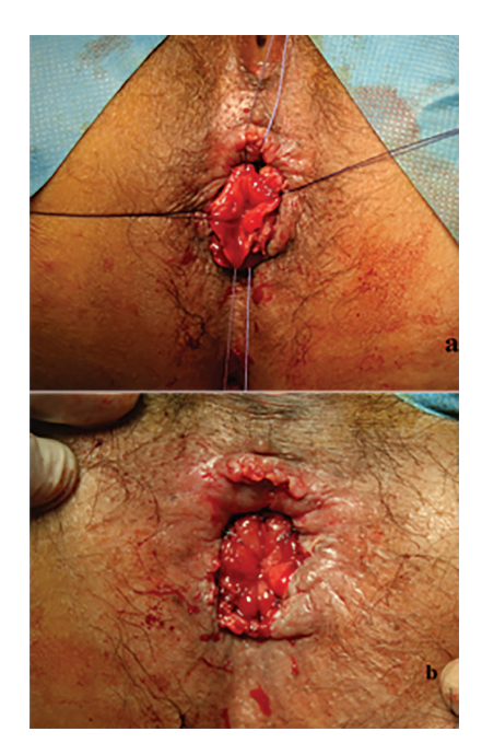
Figure 4. View of delayed coloanal anastomosis (CAA). a) During CAA, b) After the completion of CAA CAA: Coloanal anastomosis

cautery; a hand-sewn, colo-anal anastomosis was performed using 8-12 interrupted sutures at the dentate line level. The lumen was, then, checked with anoscopy (Figure 4).