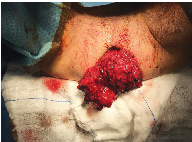
Figure 1. Preoperative image of giant rectal tubulovillous adenoma protruded from the anus