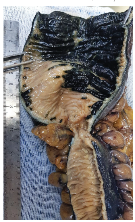
Figure 1. Tumor tissue and diffuse black-brown mucosa proximal to tumor tissue

Although there is no clear information about the incidence of melanosis coli, rates ranging from 1-59.5% have been reported. <sup>4,5</sup> It is more common in women as in our case and in older age. <sup>1,6</sup> Pigment can be observed more intensively in the cecum and ascending colon than in the distal column. <sup>1,2</sup> In our case, melanosis coli was detected in the sigmoid colon. The use of laxatives, especially laxatives containing anthraquinone, is a well-known cause for melanosis coli. It can usually develop after 4-9 months of use. With the discontinuation of use, it may recede within