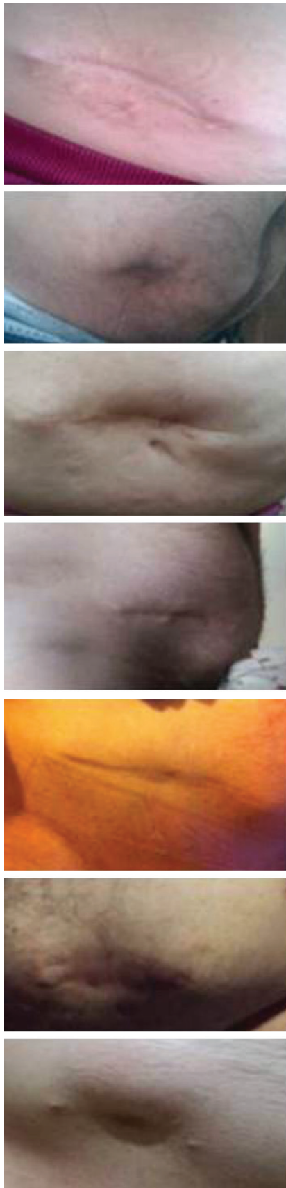
Figure 3. The appearance of dog-ear deformity in patients with linear closure technique