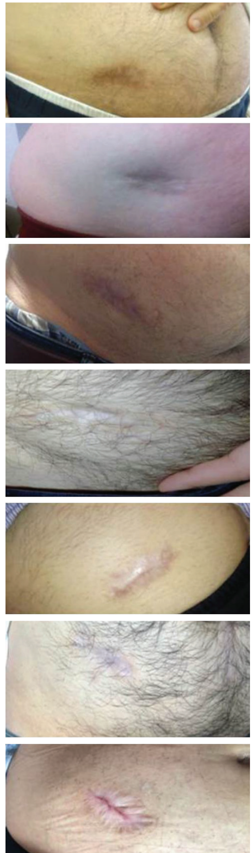
Figure 4. The appearance of the wound in the patients with purse-string closure technique