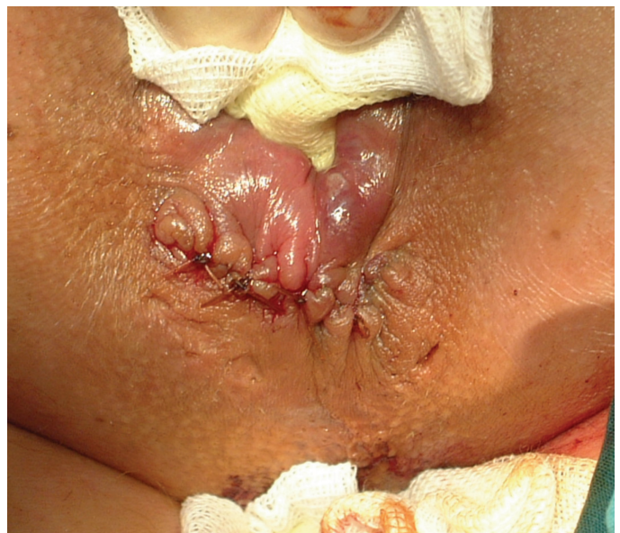
Figure 3. Appearance after excision