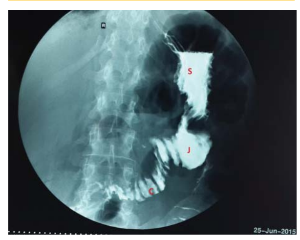
Figure 1. Image of the remnant stomach (S), transverse colon (C), and jejunal loop (J) in barium.

biopsies taken from the anastomosis line. Colonoscopic evaluation could not be done because of contamination. The patient's tomography with oral and intravenous contrast revealed that his stomach with partial resection was continuous with the jejunum and the wall integrity was lost between the stomach and the colon with the neighboring anastomosis line (Figure 3). Total parenteral nutrition was initiated pre-operatively and was continued during the post-operative period. Albumin infusion was given because of hipoalbuminemia and pretibial edema. His control pre-albumin and albumin value was normal before the surgery. No erythrocyte suspension was given to the patient before surgery because there was no symptoms due to anemia. The laparotomy performed showed partial gastrectomy, antecolic gastroenterostomy, and gastrojejunocolic fistula (Figure 4). The posterior vagus was intact. Posterior vagotomy was performed with en bloc resection including the partial resection of