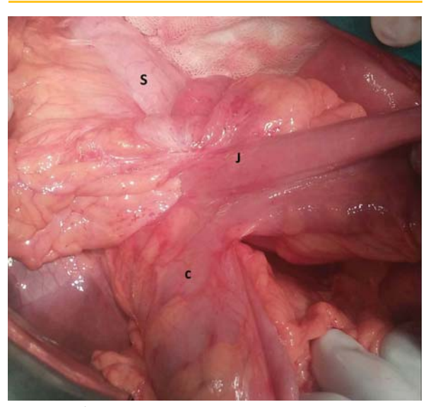
Figure 4. İntraoperative finding. S, Stomach; J, Jejunum; C, Colon.

the colon and jejunum, and subtotal gastrectomy. Stomach continuity was achieved by Roux-en-Y gastrojejunostomy. Primary anastomosis was performed for the colon. The patient was taken into the opearating room and relaparotomy was performed on the second postoperative day upon observing that the patient had hypotension and tachycardia alongside with 1200 cc hemorrhagic discharge from the abdominal drain. It was seen that the bleeding originating from the resected mesocolon stopped spontaneously and the feeding in the colonic segment was fine. The patient had drainage and was administered 3 units of erythrocyte suspension in order to ameliorate anemia. The patient, who developed 'Transfusion Related Acute Lung Injury' (TRALI), died on the third post-operative day following transfusion in spite of supportive treatment.