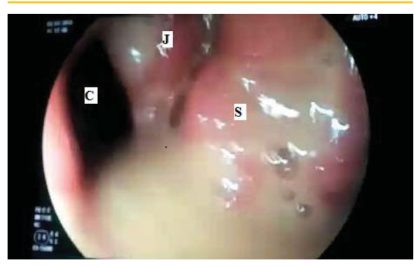
Figure 2. Endoscopic image of gastrojejunocolic fistula (S, Stomach; J, Jejunum; C, Colon).

biopsies taken from the anastomosis line. Colonoscopic evaluation could not be done because of contamination. The patient's tomography with oral and intravenous contrast revealed that his stomach with partial resection was continuous with the jejunum and the wall integrity was lost between the stomach and the colon with the neighboring anastomosis line (Figure 3). Total parenteral nutrition was initiated pre-operatively and was continued during the post-operative period. Albumin infusion was given because of hipoalbuminemia and pretibial edema. His control pre-albumin and albumin value was normal before the surgery. No erythrocyte suspension was given to the patient before surgery because there was no symptoms due to anemia. The laparotomy performed showed partial gastrectomy, antecolic gastroenterostomy, and gastrojejunocolic fistula (Figure 4). The posterior vagus was intact. Posterior vagotomy was performed with en bloc resection including the partial resection of